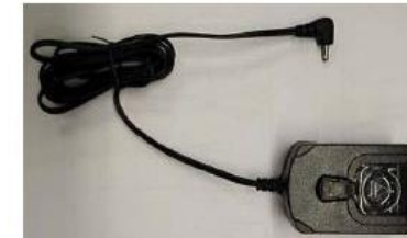
PWR-WUA5V4W0US Power Supply 5.2v, 1.1A